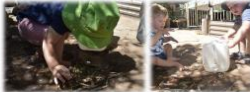
Caring for our garden, our worms and working towards a sustainable future.