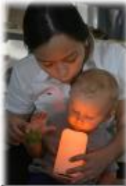
Bed time rituals..