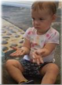
Using my "gentle hands" as I hold the worms.